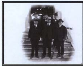
Dundas Museum and Archives Photograph Collection P-310. Bertram and Sons Co. staff, c. 1916.

The cards are arranged alphabetically and by geographical area. A list of all family names can be found on our website.