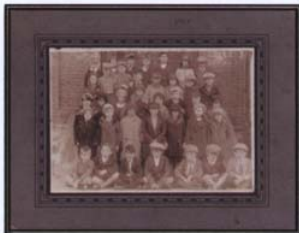
Dundas Museum and Archives Photograph Collection P-909. Entrance class, 1932.