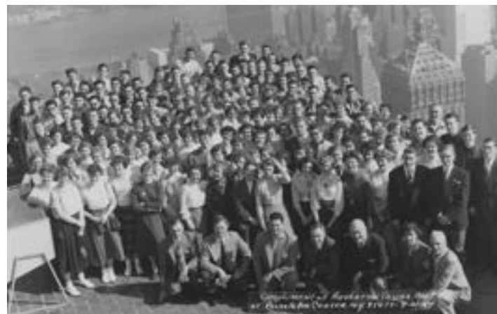
Class trip to New York City, April 21st, 1954