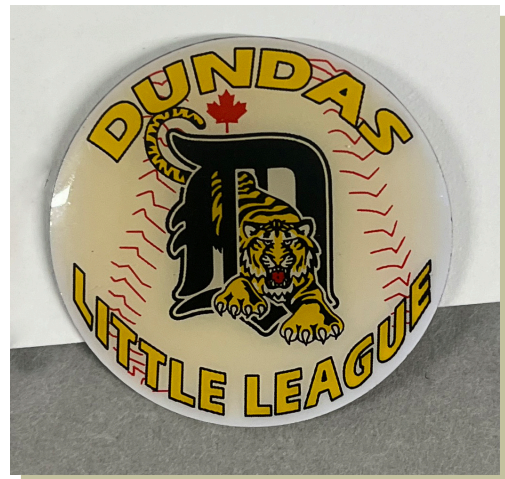
2023.005: Dundas Little League Pin