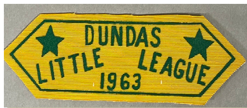
2018.012.009: Dundas Little League Patch, 1963