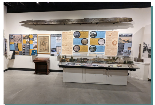
The canal piling in its new home, suspended above the Desjardins Canal model, May 2024.