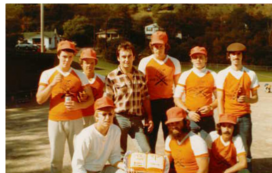
Valley City Manufacturing Baseball Team, 1980