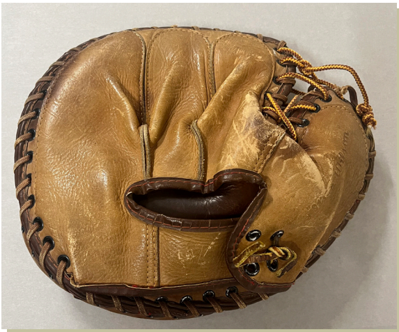
2023.012.002: Catcher's Mitt