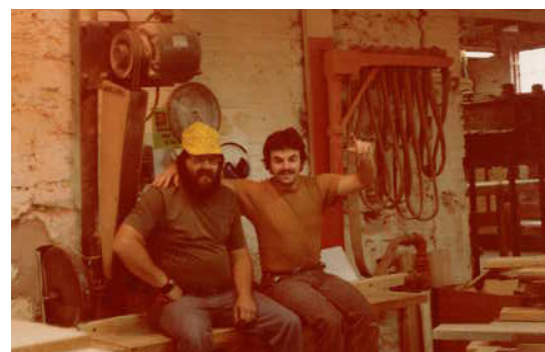
Employees at Valley City Manufacturing, 1976